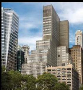
5 BRYANT PARK MAJOR LOBBY RENOVATION COMPLETE