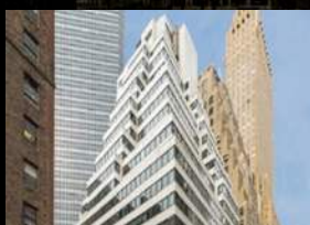
360 LEXINGTON MAJOR LOBBY RENOVATION UNDERWAY