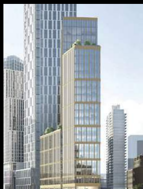
141 WILLOUGHBY MAJOR GROUND UP DEVELOPMENT