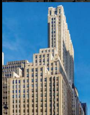
521 FIFTH MAJOR LOBBY AND BUILDING RENOVATION UNDERWAY