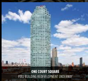
ONE COURT SQUARE FULL BUILDING REDEVELOPMENT UNDERWAY